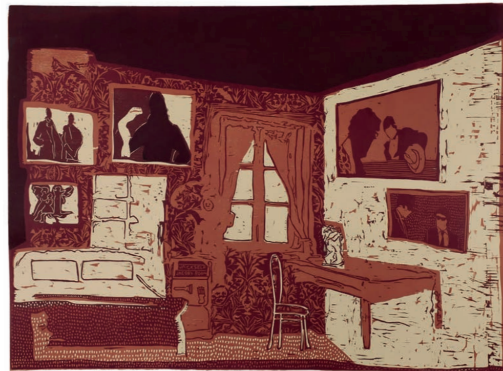
Above Jacob's Room (2021) Jake Garfield. Woodcut and stencil. 560 x 760mm. At 8 Holland Street and The Fitzwilliam Museum

Stuart Moir. Linocut. 4.40 x 560mm. At Fire Station Creative