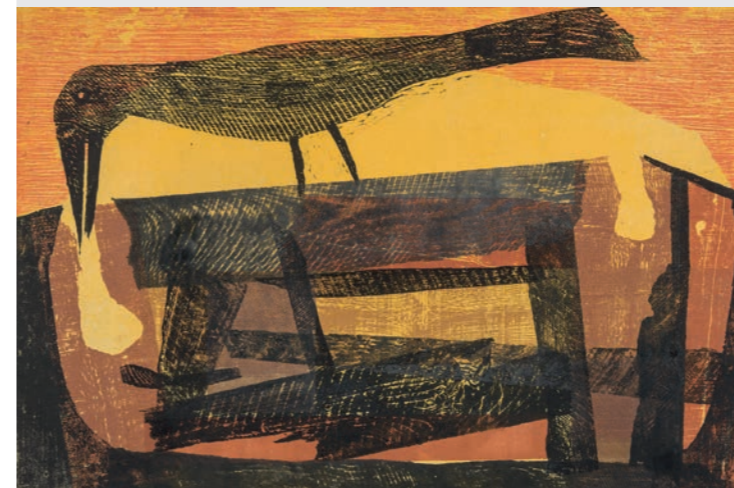
Bird (1960) Tadek Beutlich. Relief print, hardwood, lino and plywood. 520 x 790mm.